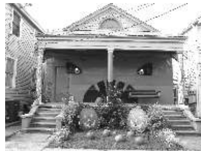
This house was on the 400 block of Eliza St. but no one figured it out . Better luck this month.