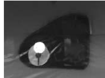
This was an amazing show of creativity. It's the scariest thing I have ever seen.