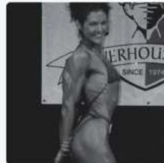
AFTER (175lbs lighter)